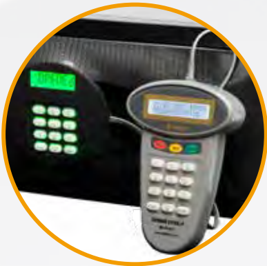
Emergency Handheld Override

Concealed behind a magnetic plate, the UL-rated Medeco™ cylinders are customized to each property with a unique pinning code. Unlike skeleton keys, the Medeco™ key cannot be easily copied and additional keys are only available from the manufacturer with proper authority. The lock is virtually pick proof and cannot be bumped.