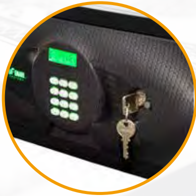
Medeco™ Key Override

Hotels depend on reliable, emergency access to their safes and Safemark's industry-leading override systems deliver confidence. Safemark will undoubtedly meet your security needs while maintaining the design integrity of your guest room.