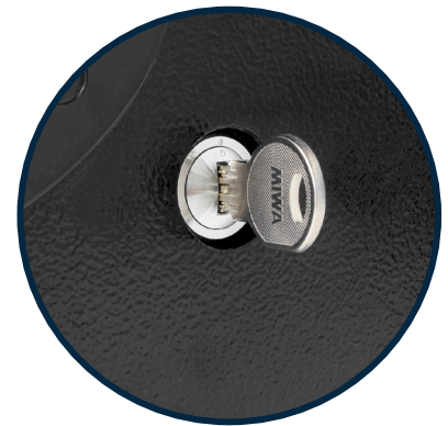
High Security Key Override

Concealed behind a plate, the cylinders are customized to each property with a unique pinning code. Unlike skeleton keys, the high security keys cannot be easily copied and additional keys are only available from the manufacturer with proper authority. The lock is virtually pick proof and cannot be bumped.